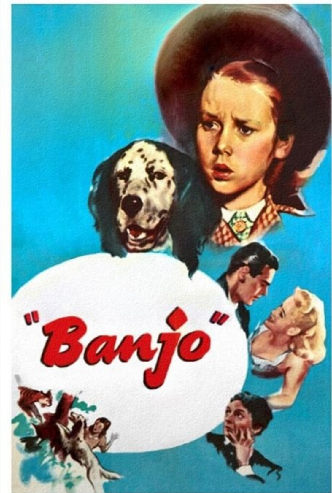
Full movie of ben 10. Indian movie banjo. Full meaning of ban.